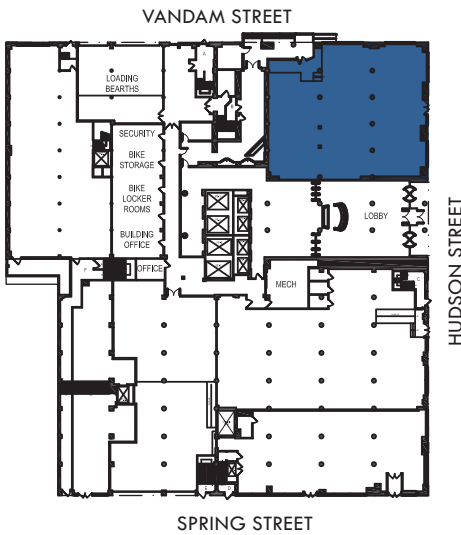
Key Plan - Not to scale